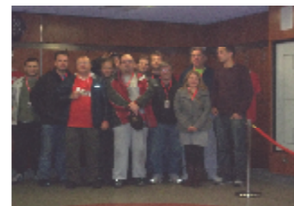
The teams in Manchester United's changing room