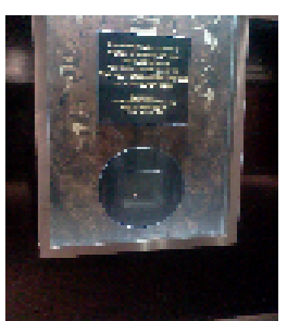
The eternal flame in memory of the 1958 Munich plane crash