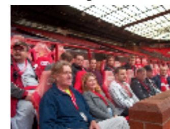
A rapt audience