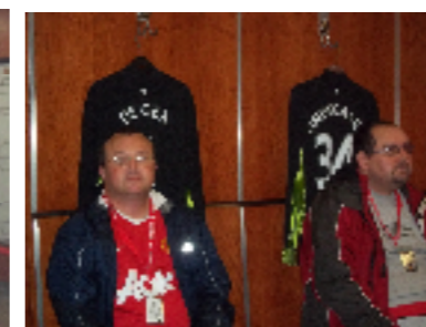
Listening to the facts and figures