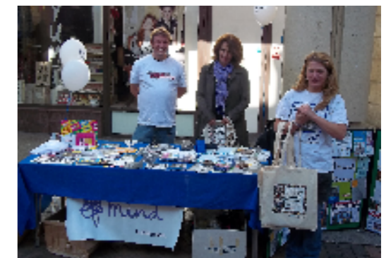
The stall at the Bentall Centre