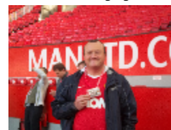
Des. A dream fulfilled!